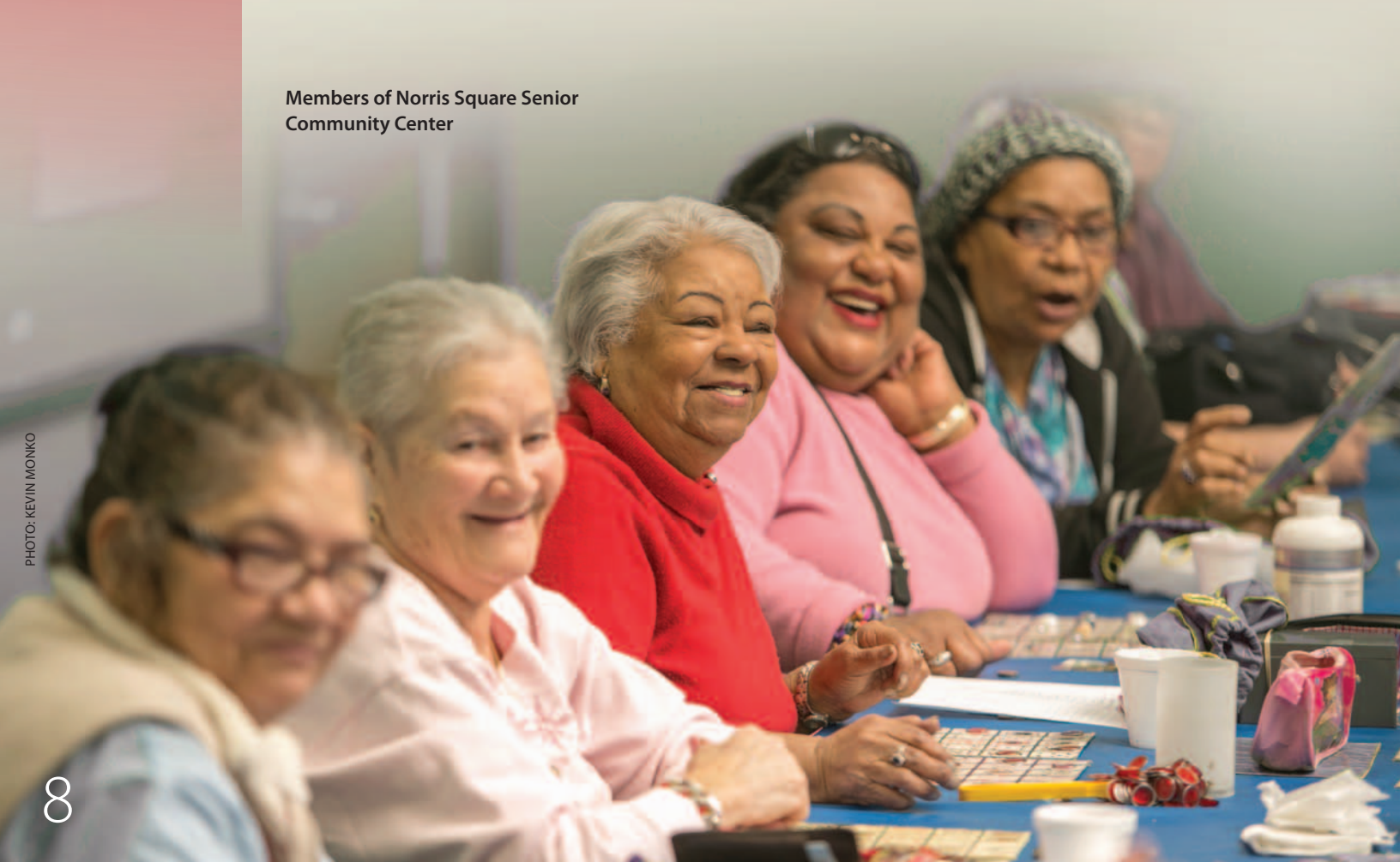
Members of Norris Square Senior Community Center