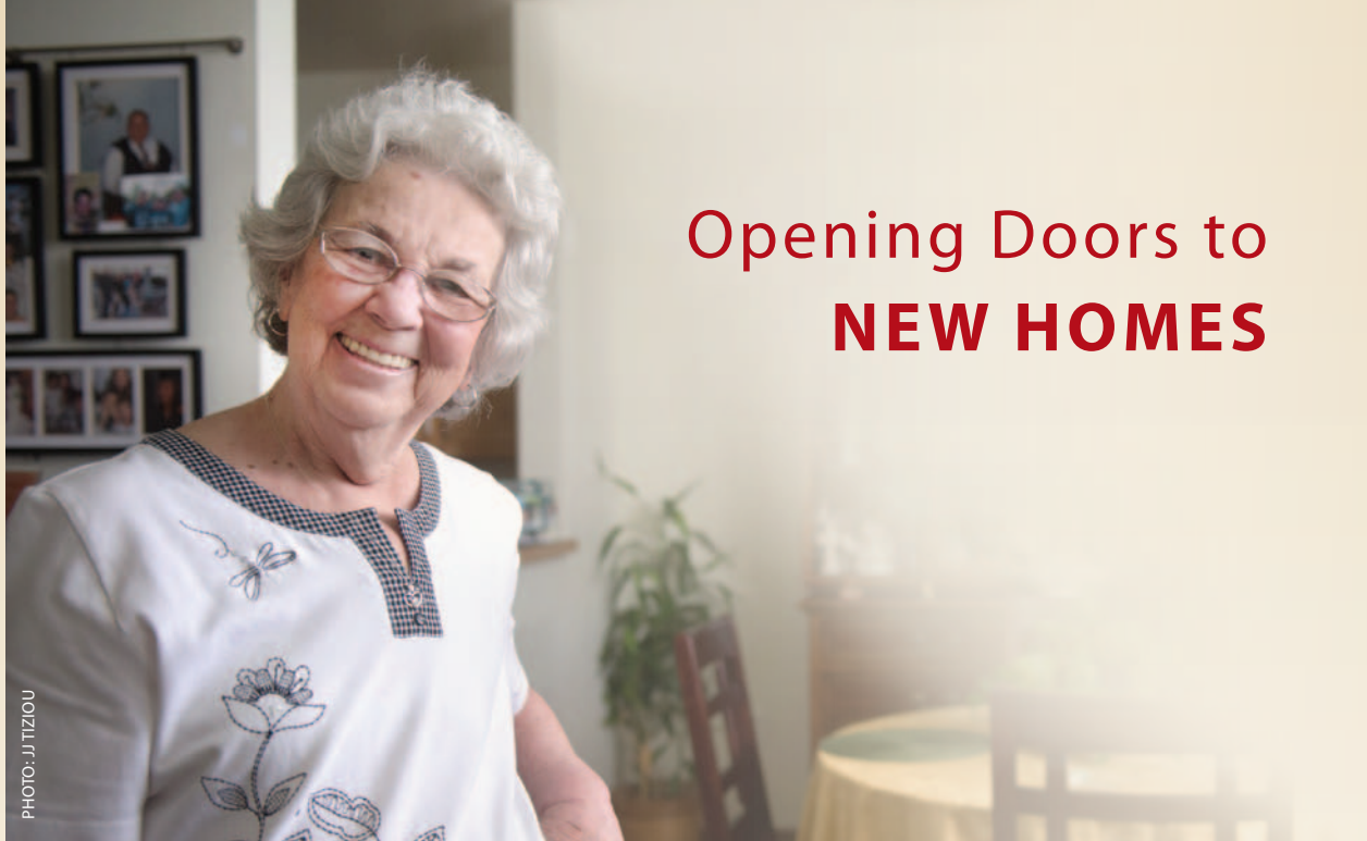
Resident of St. John Neumann Place