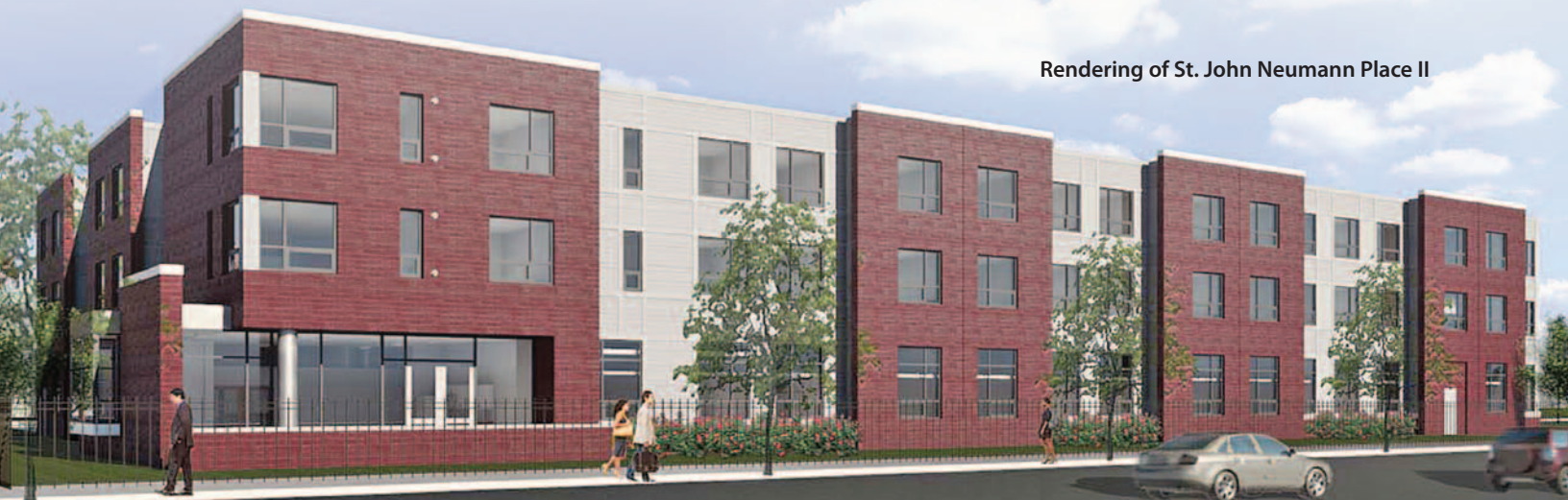
Rendering of St. John Neumann Place II

Catholic Health Care Services is not just providing housing, but Opening Doors to new homes where individuals recreate their lives, begin to walk taller and come to appreciate their enduring dignity and worth. Crossing over each threshold at Nativity BVM Place is an invitation to enter a home filled with rich stories that slowly begin to unfold. From a collection of records to paintings commemorating trips abroad, every apartment is a sacred space into which each resident breathes life.