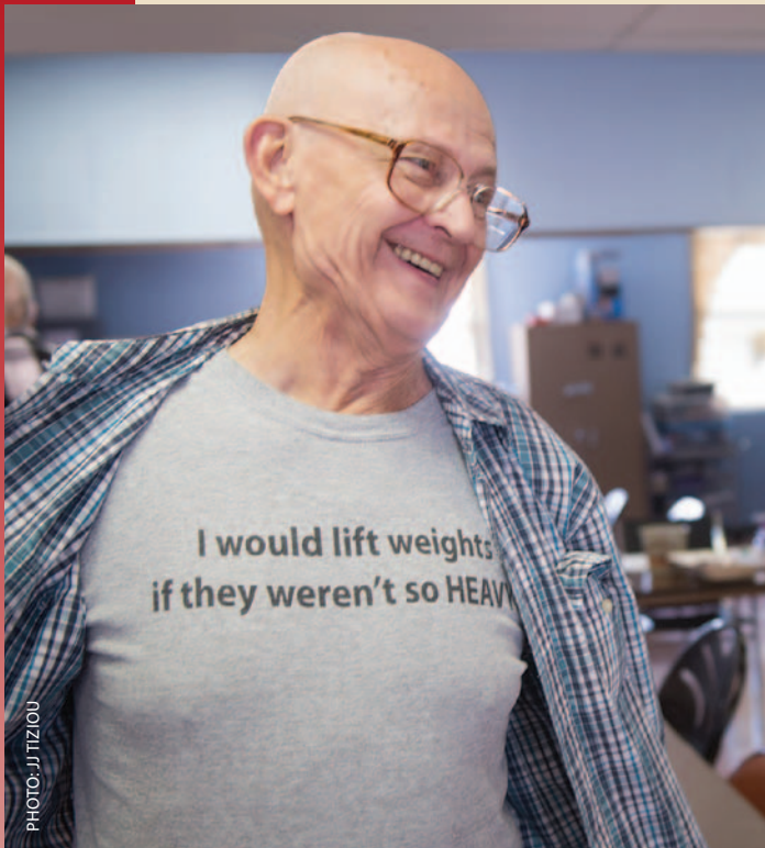
Member of St. Anne's Senior Community Center

Walking through the doors of Norris Square Senior Community Center, members are welcomed with a flurry of inviting activities, a collection of friendly faces, and the buzz of lively conversation. Nestled in a primarily Spanish-speaking community, the center is the preferred gathering spot for local seniors because it is so full of energy and vitality.