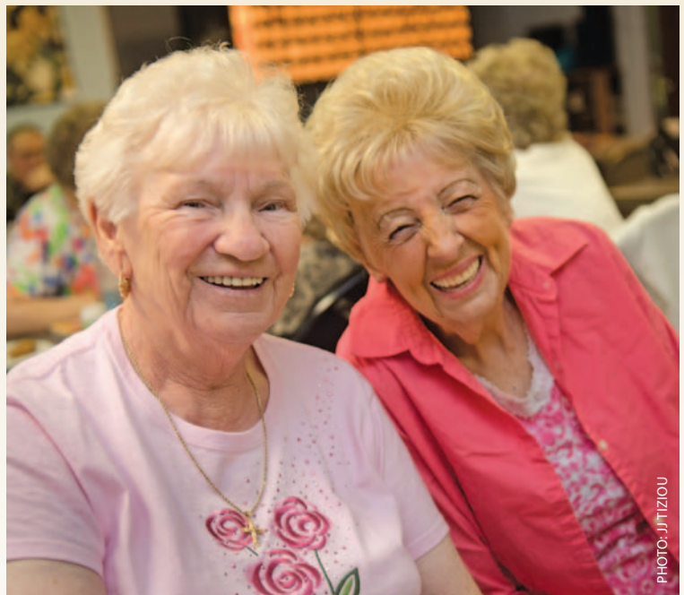
Members of St. Anne's Senior Community Center