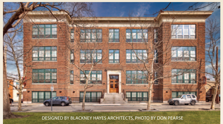
Nativity BVM Place

St. Francis Villa under construction and set to open in the Summer of 2016