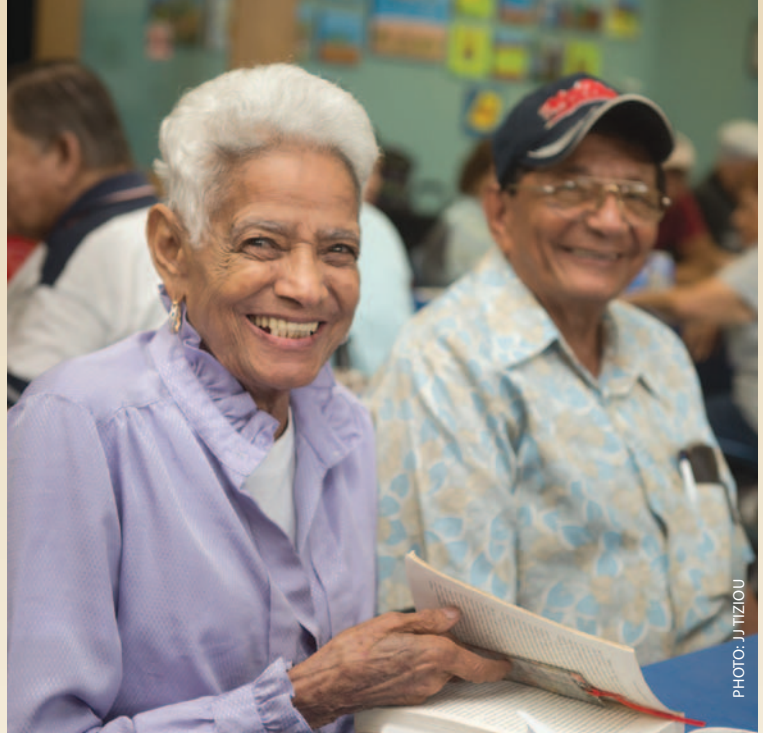
Members of Norris Square Senior Community Center

2,012 seniors attended the Senior Community Centers in 2015