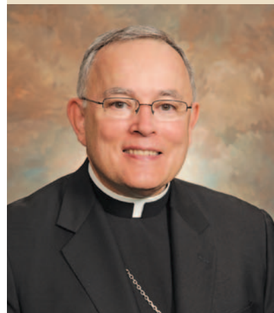
Most Reverend Charles J. Chaput O.F.M. CAP., DD Archbishop of Philadelphia

I commend Catholic Health Care Services for its continued dedication to our seniors, and gratefully acknowledge the essential contributions of our skilled professional staff, dedicated volunteers, generous donors, and committed board members. Their shared commitment to our aging brothers and sisters is another expression of the Church of Philadelphia's response to our Holy Father's exhortation to "bear witness to our faith with greater enthusiasm and conviction" and fulfill "our responsibility to be a living sign of the Father's love in the world." As the People of God, we are grateful for their enduring witness.