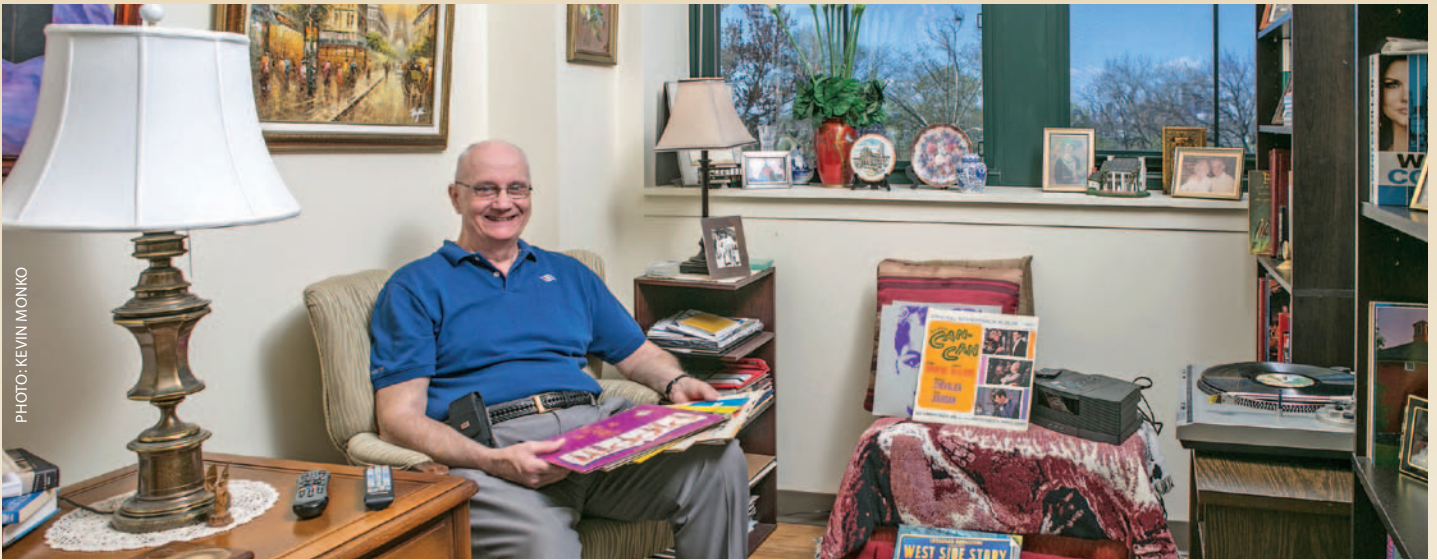
Resident of Nativity BVM Place

The need for affordable senior housing is prevalent throughout our region. On a hot summer day in July, one hundred and forty seniors waited in line for an application for Nativity BVM Place. Scheduled to begin at 10 am, the first applicant arrived at 6 am, wanting so desperately to gain her spot in the repurposed building. Catholic Health Care Services is keenly aware of this significant need and is continuing to grow the affordable senior housing program. With two senior housing communities currently in operation, CHCS will be opening two additional communities by 2017, providing 230 apartments to seniors across the region, and with more developments on the horizon. This growth will ensure that seniors like Margaret have affordable, well designed housing in the neighborhoods and parishes that they have supported and nurtured for decades.